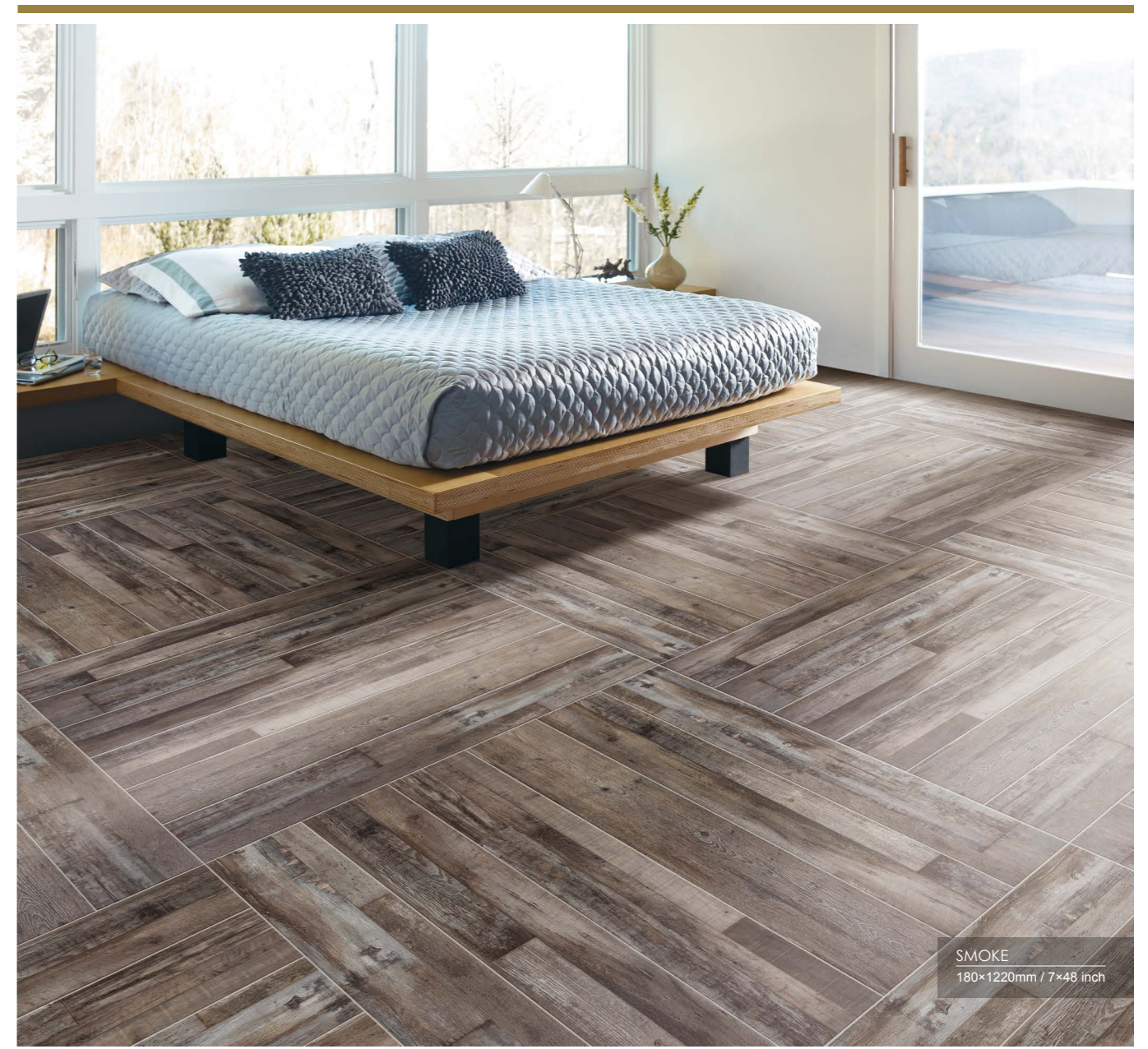
SMOKE 180x1220mm / 7x48 inch