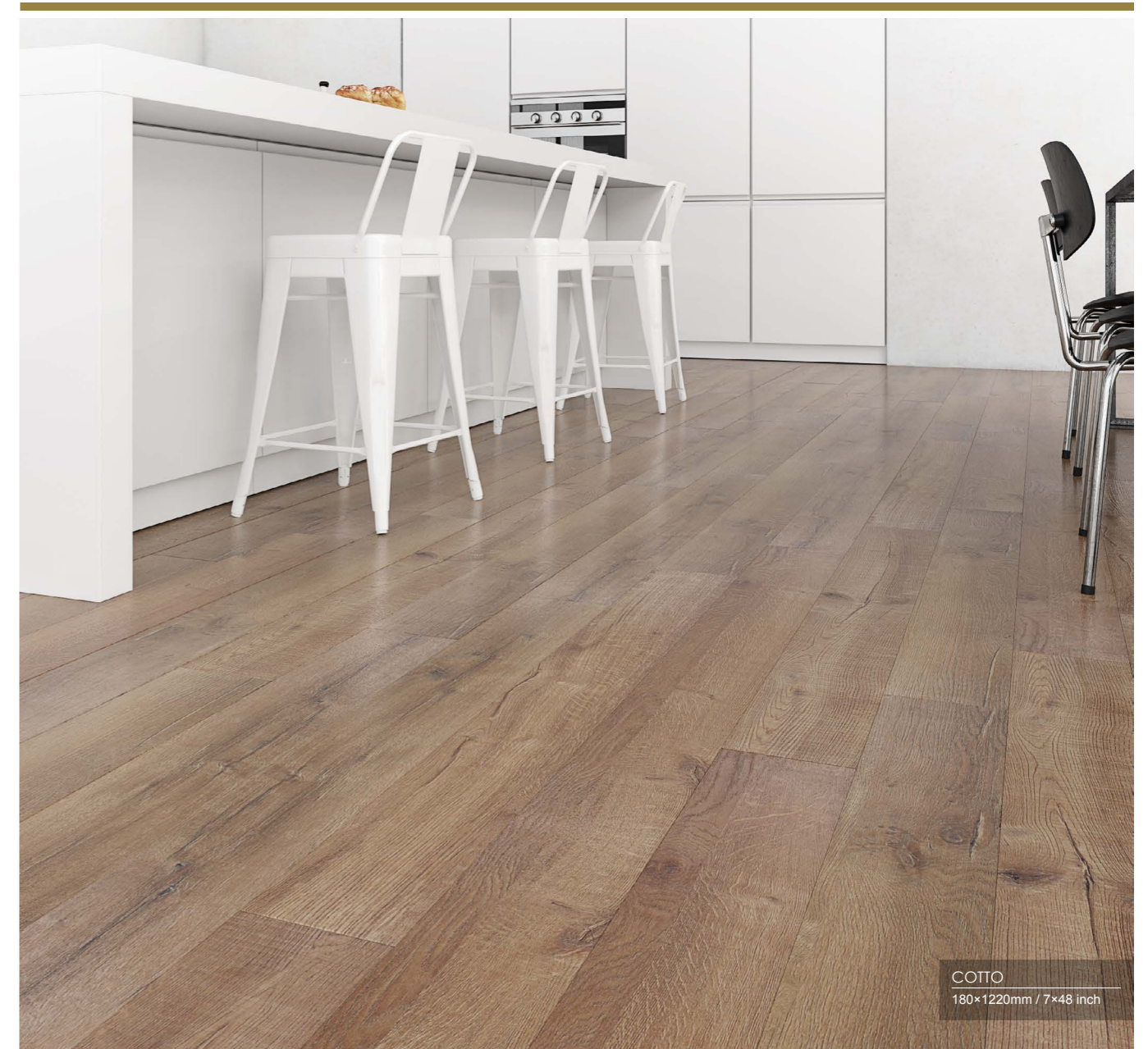
COTTO 180x1220mm / 7x48 inch