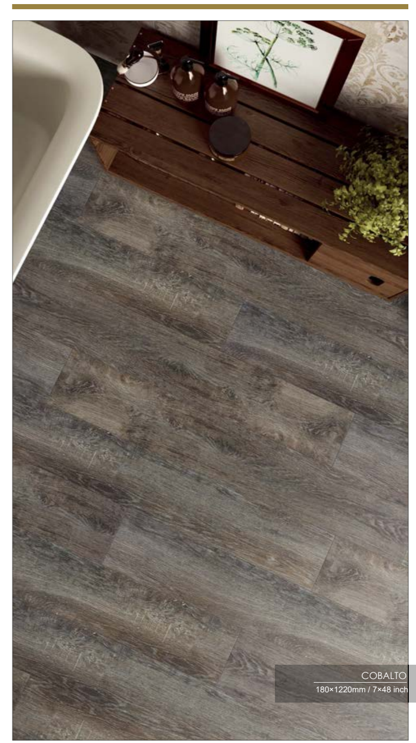
COBALTO 180x1220mm / 7x48 inch