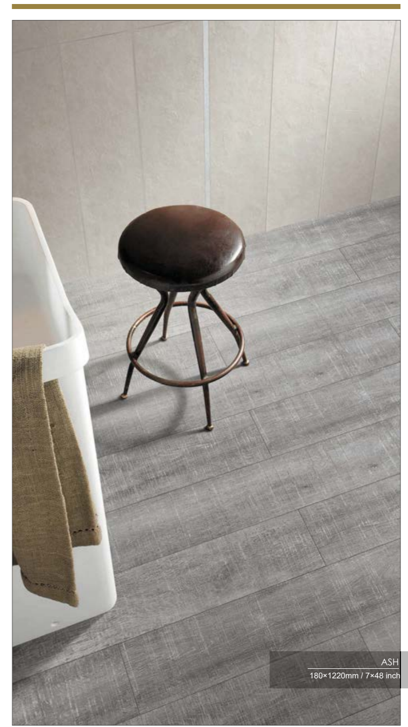
ASH 180x1220mm / 7x48 inch